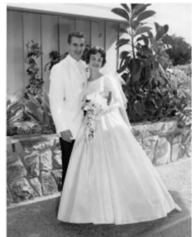
Schroeders Fighting HD!